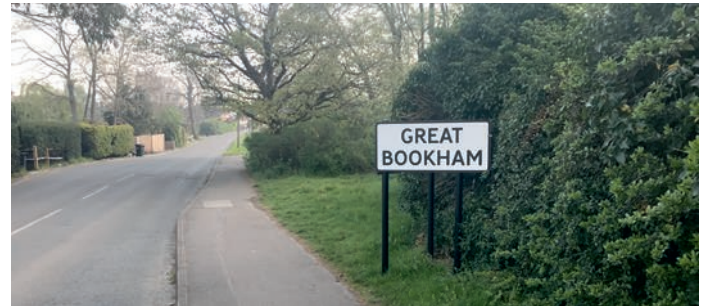
Little Bookham and Great Bookham boundary on Little Bookham Street