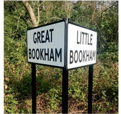
Great Bookham and Little Bookham boundary on Lower Road