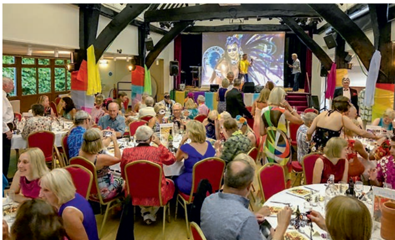
Revellers at last years SPACE Carnival Ball