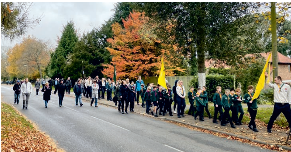
Bookham Scouts walking to the Friendship Tree in 2021 when Lower Road was shut for drainage works.