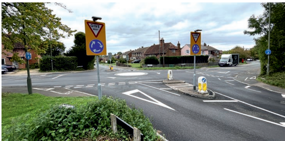
Resurfacing work has been completed at Preston Cross and Lower Road junction

The summer has been exceptionally dry, avoiding any of the usual flooding problems experienced throughout the village..