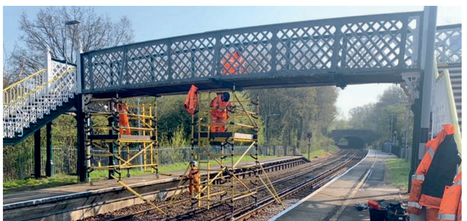
Work in progress on the footbridge.

Western Railway (LSWR) . Our railway station was first called "Bookham & Effingham" but assumed its present name when a station was built at Effingham Junction three years after the line opened in July 1888 two miles north of the village. The 91-yard tunnel was insisted upon to avoid spoiling the common.