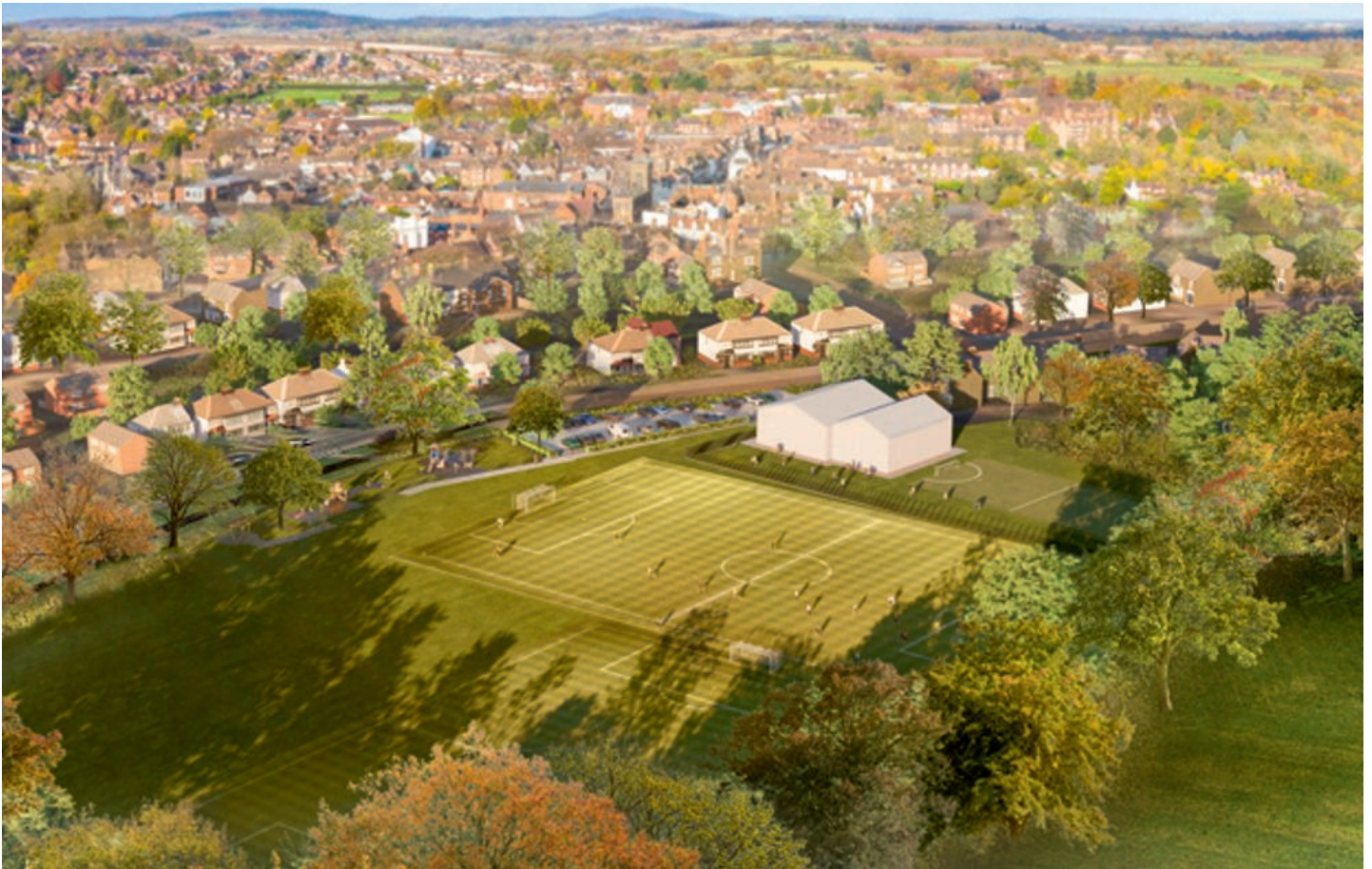
Computer generated image provided by Surrey CC. This is for indicative purposes only and not the final design.