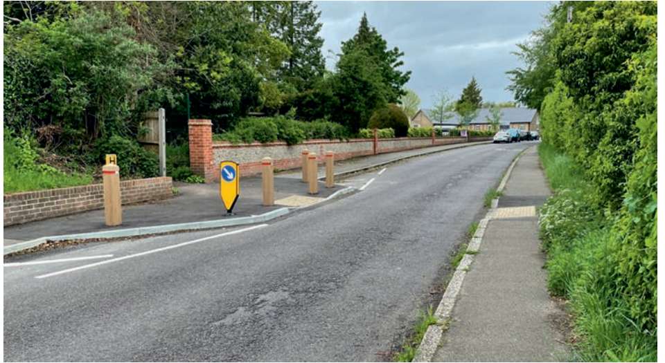
Recently completed Build out in Rectory Lane to provide a safe crossing point for pedestrians.